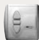
Centralis uno RTS